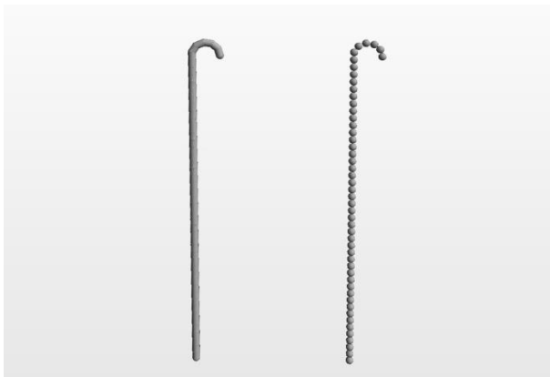
Figure 2. On the left, the continuous flexible endoscope model; on the right, its discretization.

In order to simulate the flexible endoscope, the solid model was discretized in a finite number of solid elements (spherical nodes), as depicted in Figure 2.