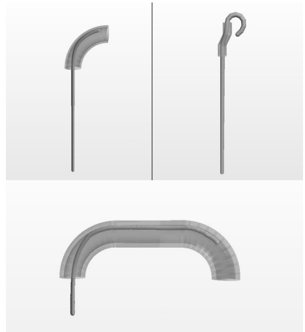
Figure 3. Performance of the simulated endoscope model in three different scenarios.

For creating an accurate and realistic training platform, navigation through a three dimensional ureterorenal model was implemented. The 3D model was previously acquired with a CT scan on a real urinary tract.